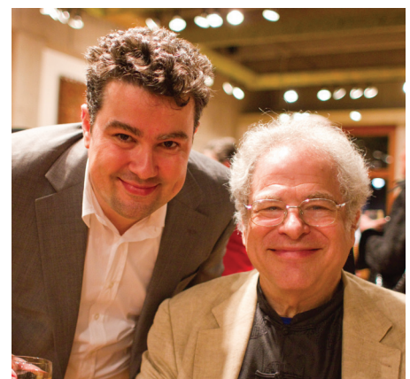
▲ Rachev with violinist Itzhak Perlman, September 2014.